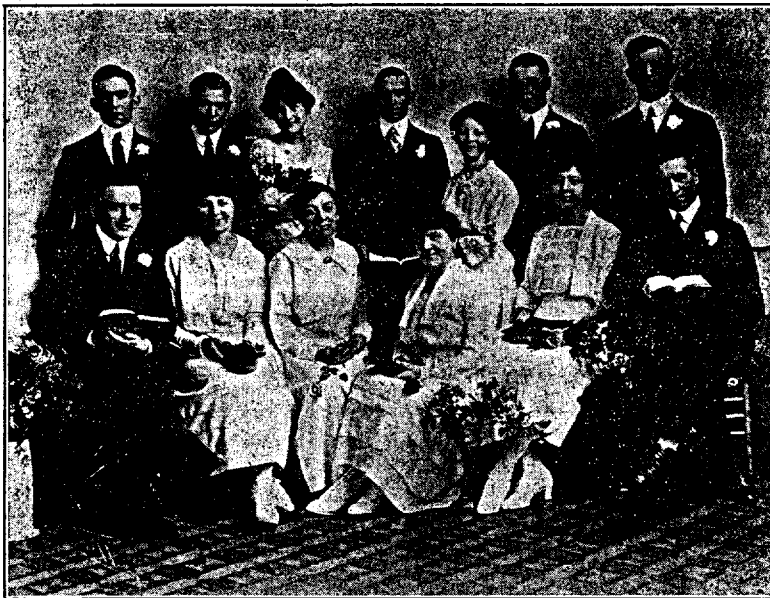
GLAD TIDINGS GRADUATION, SAN FRANCISCO, CALIF.

The Glad Tidings Bible Training School has just closed its third successful year. On May 6th there was graduated this fine class whose picture appears here.